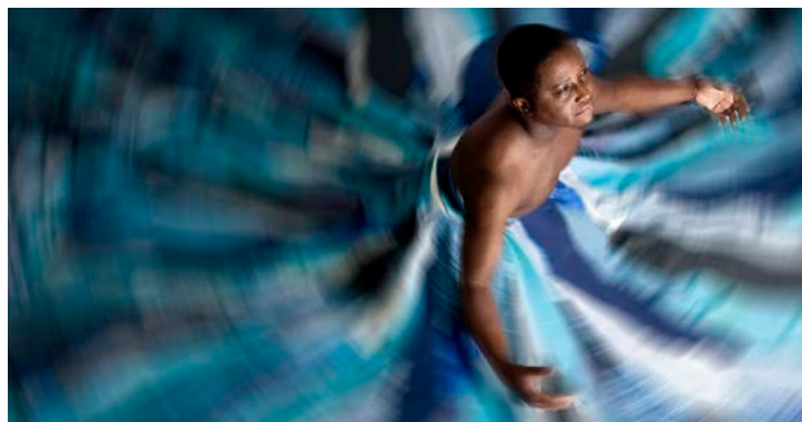
Today, Tchando presents us his new album: << BA >>

In 2008 the "Bliss" song "Kissing" co-written by Tchando has been included in the sound track compilation for the movie "Sex and The City" (USA), inspired by the famous American series of the same name.